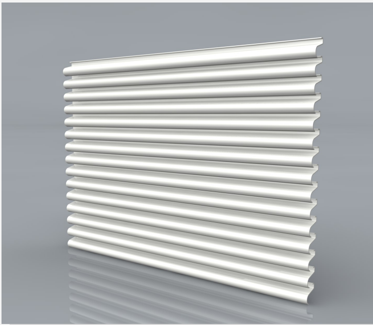
pictured: aluminum louver

FlowGrill louvers are developed for extreme circumstances and available in different designs, many functional executions and additional options.